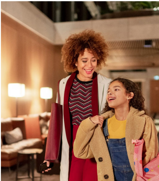
Energy and Building Technology