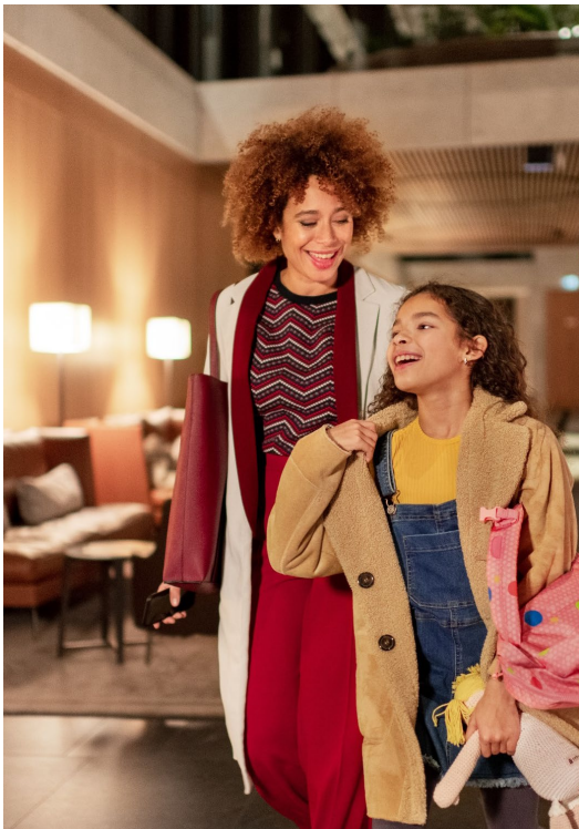
Energy and Building Technology